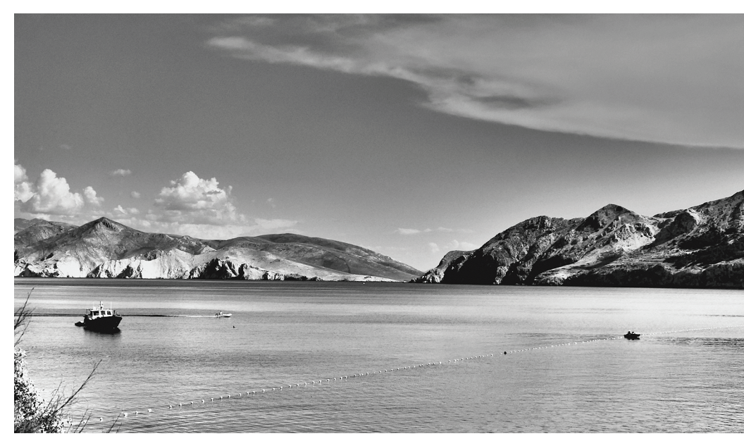
Mountains and sea, movement and stillness, limitlessness and boundaries. Krk Island, Croatia, 2021