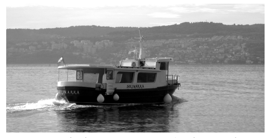
FIGURE 1 The Solinarka Boat During its Journey from the Pier in Ankaran to the Open Sea, Where the Ashes Are to Be Scattered

CD or USB key or a live performance by a musician. The second part of the ritual consists in moving from the mortuary to the graveside. This part usually takes place in silence or starts with recorded music which can be heard as long as it is within the range of the microphones (bearing in mind that the grave may be relatively far away from the mortuary). At the graveside, music is usually performed as soon as the funeral procession arrives, after which speeches may be said or read. If the funeral is of a religious nature, the word is given to a priest, who blesses the grave. The speeches may be followed by more music. Burial usually takes place in silence and often another musical piece is played at the very end of the ritual. In Slovenian coastal areas, there is also a funeral ritual that takes place on a boat, after which the ashes are scattered into the sea.